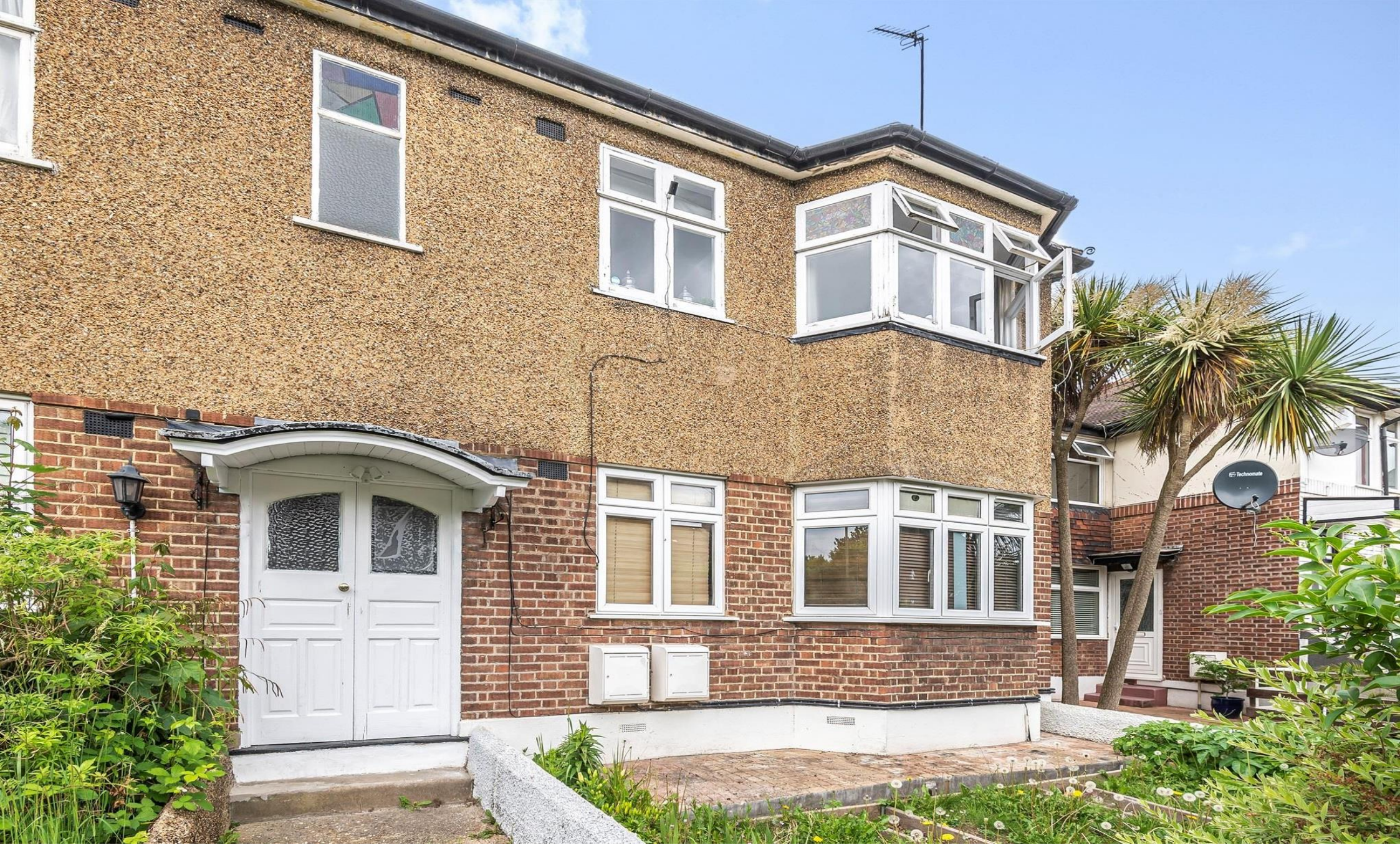
Alexandra Road, London, N10 2RT