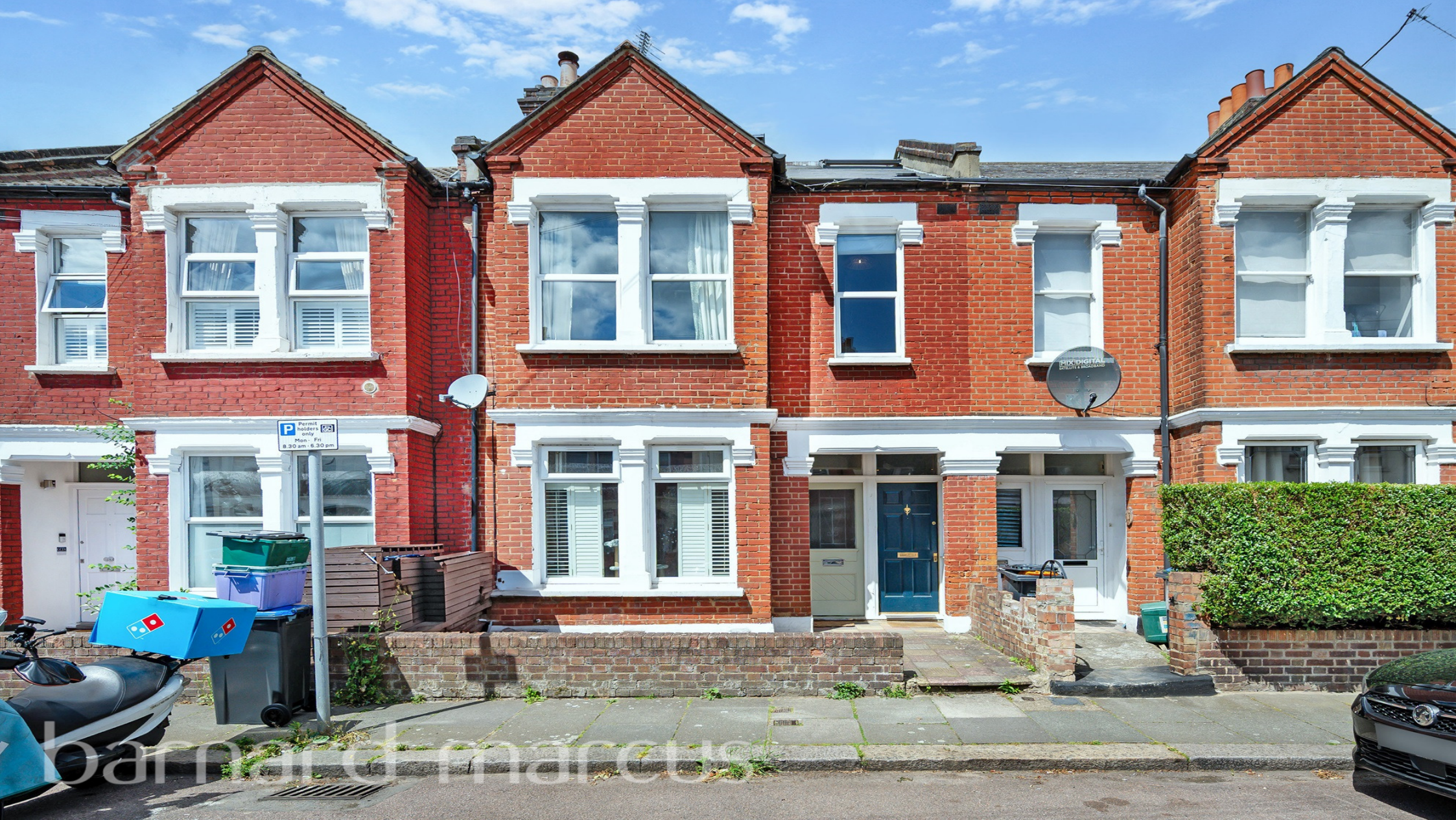
Bruce Road, Mitcham CR4 2BJ

Not for marketing purposes INTERNAL USE ONLY