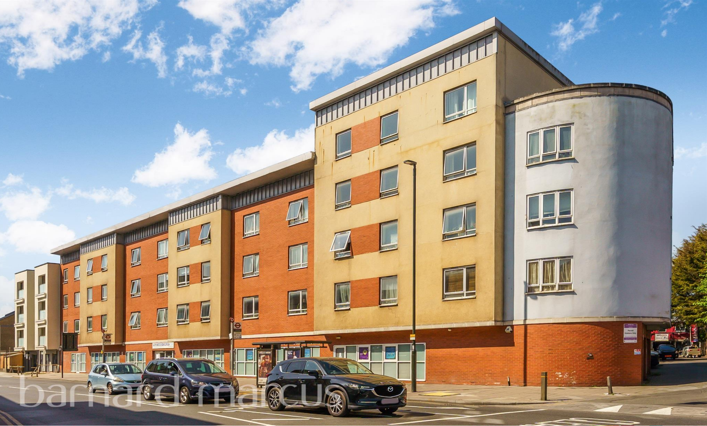
Churchill House London Road, Mitcham CR4 3SJ