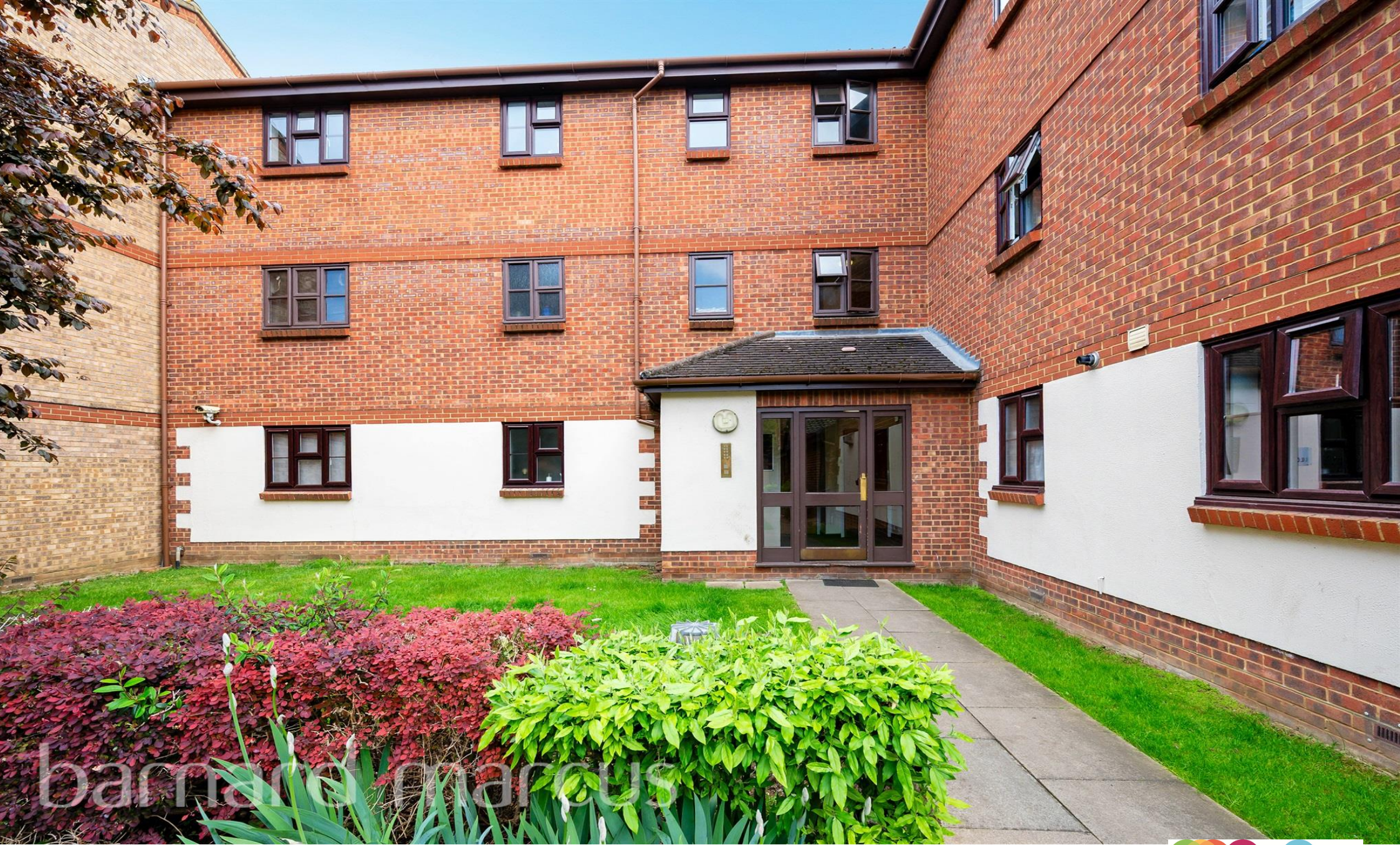
Longlands Court Spring Grove, Mitcham CR4 2NQ