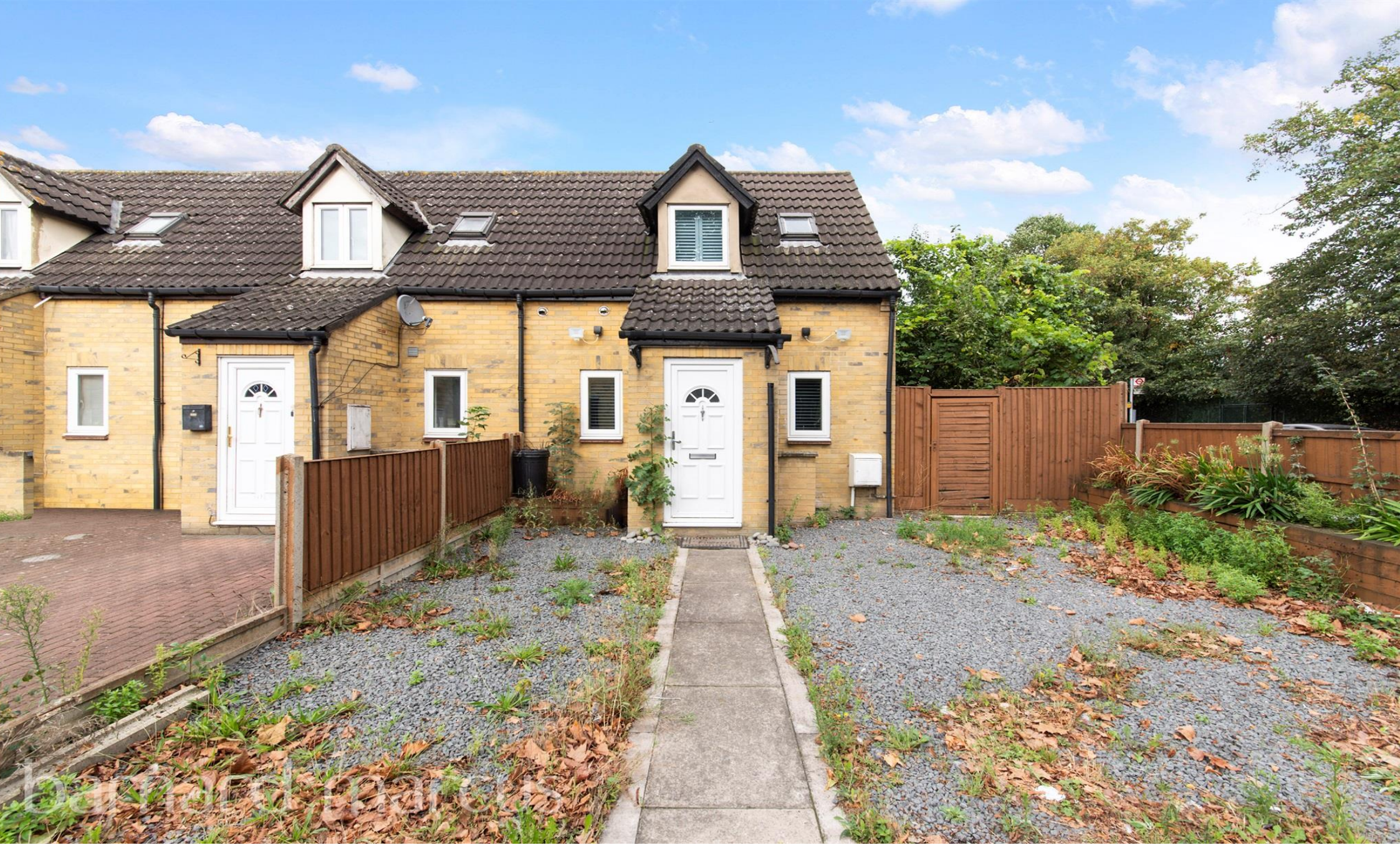
Grove Road, Mitcham CR4 1SL