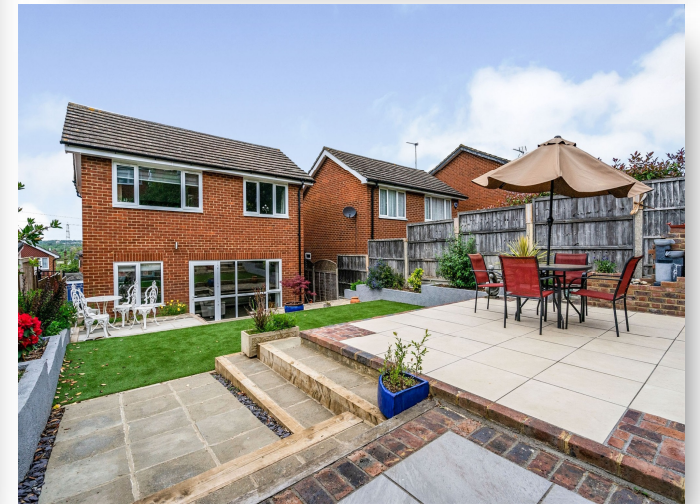
John Eliot Close, Nazeing Waltham Abbey EN9 2NZ