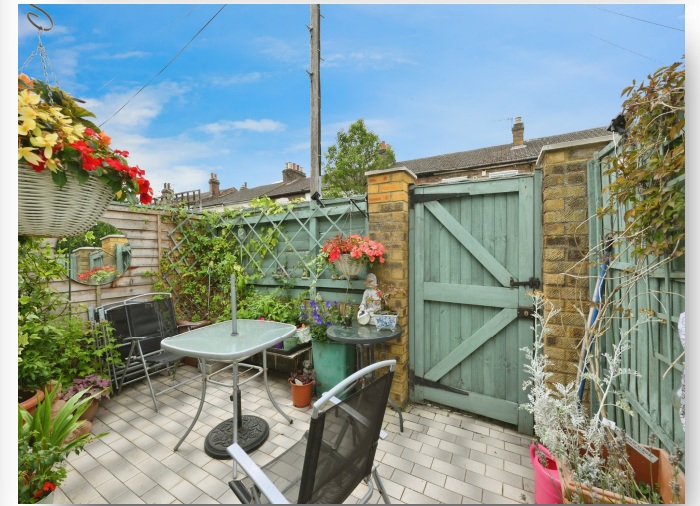
Queens Road, Waltham Cross EN8 7HT