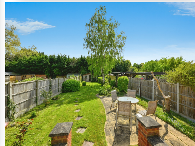
Green Pastures Tatsfield Avenue, Nazeing Waltham Abbey EN9 2HH