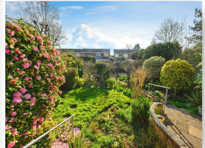
Priory Close, Broxbourne EN10 6AB