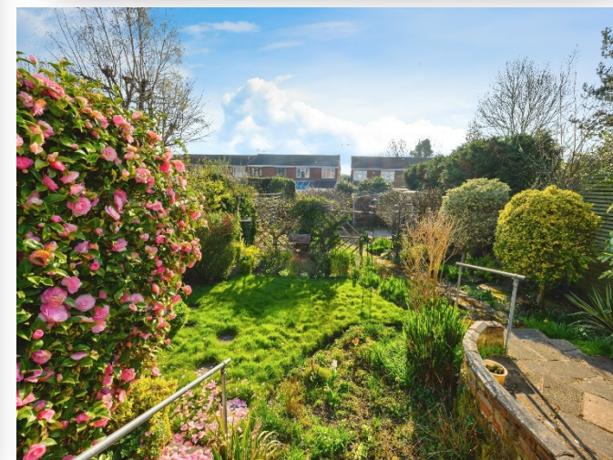
Priory Close, Broxbourne EN10 6AB