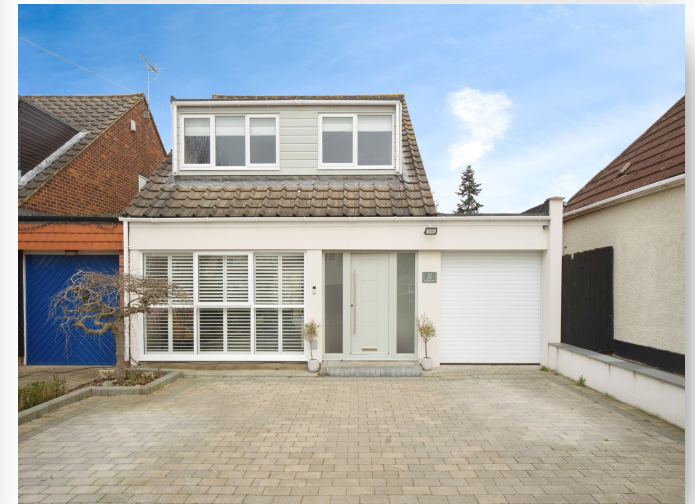
The Rowans Tatsfield Avenue, Nazeing Waltham Abbey EN9 2HH