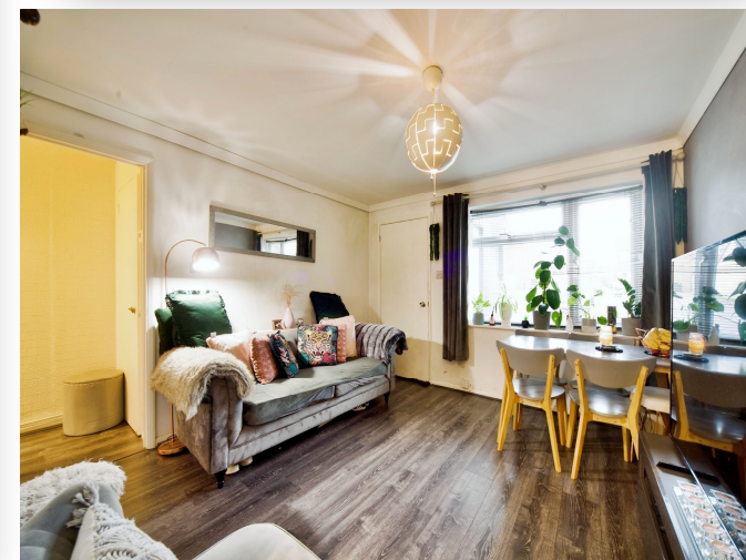
Shanklin Close, Cheshunt Waltham Cross EN7 6HF