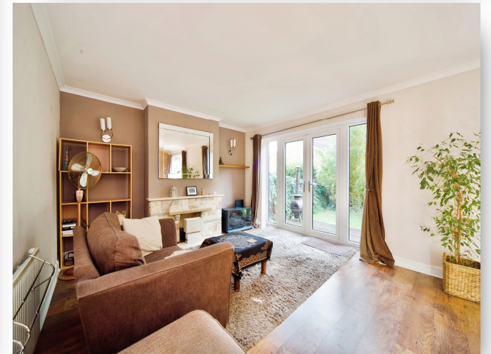
Badgers Croft, Broxbourne EN10 7ED