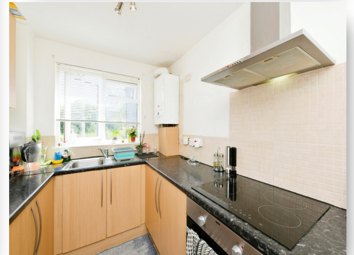
Landau Way, Broxbourne EN10 6LW