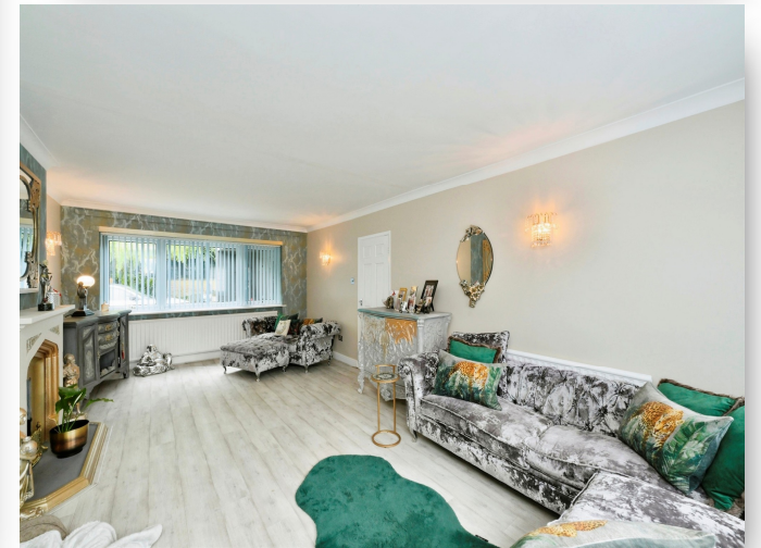
Elmscott Nazeing Road, Nazeing Waltham Abbey EN9 2HU