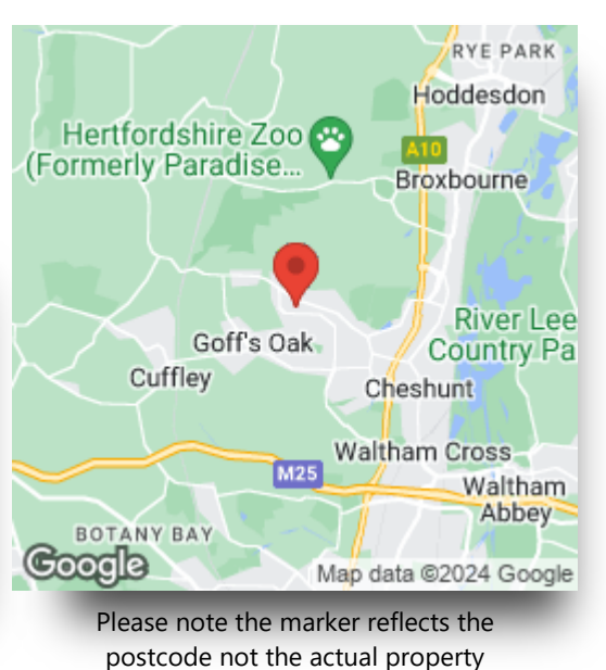
view this property online williamhbrown.co.uk/Property/BRX108630