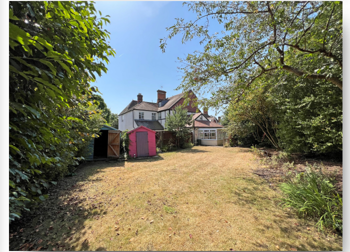
St. Catherines Road, BROXBOURNE EN10 7LG