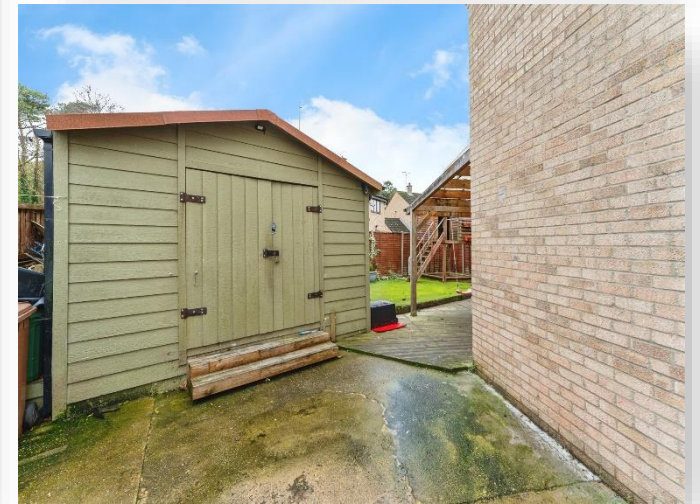
Willow Close, Brandon, IP27 0UJ