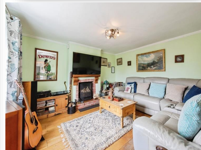
Church Lane, Northwold IP26 5LY