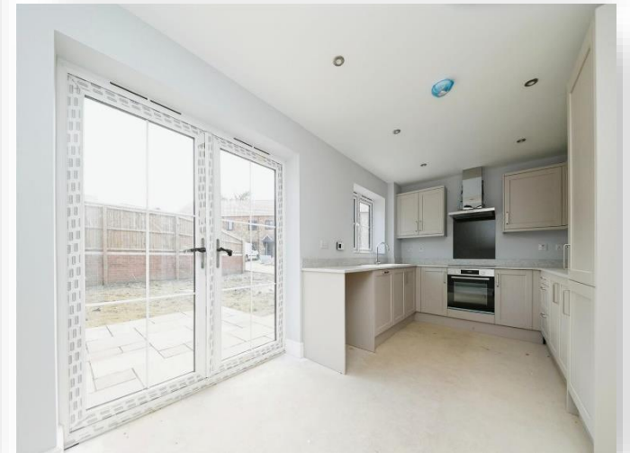
Church Views, Crown Street, Methwold, Thetford, IP26 4NR