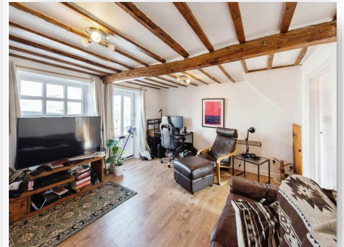
West End, Northwold, Thetford, IP26 5LG