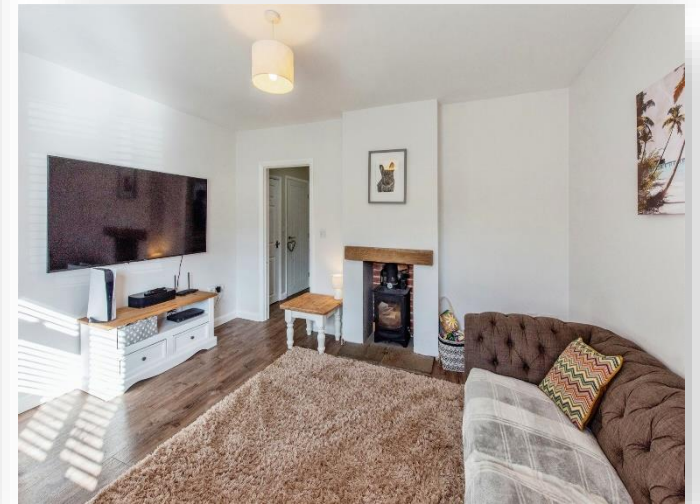
Wilton Road, Feltwell, Thetford, IP26 4AY