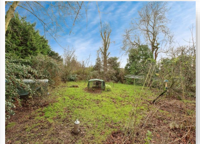
Hall Drive, Lakenheath, Brandon, IP27 9JT