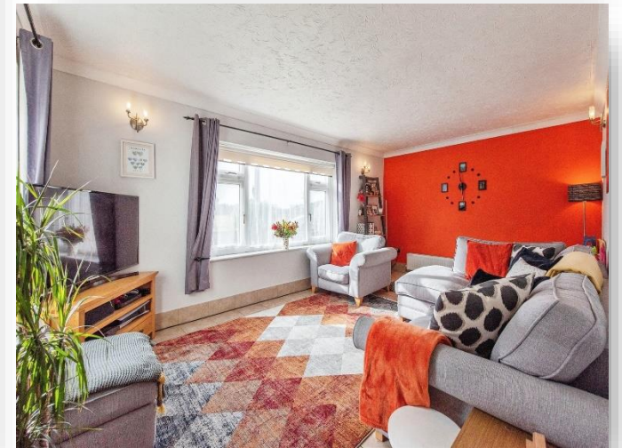
Peppers Close, Weeting, Brandon, IP27 0PU