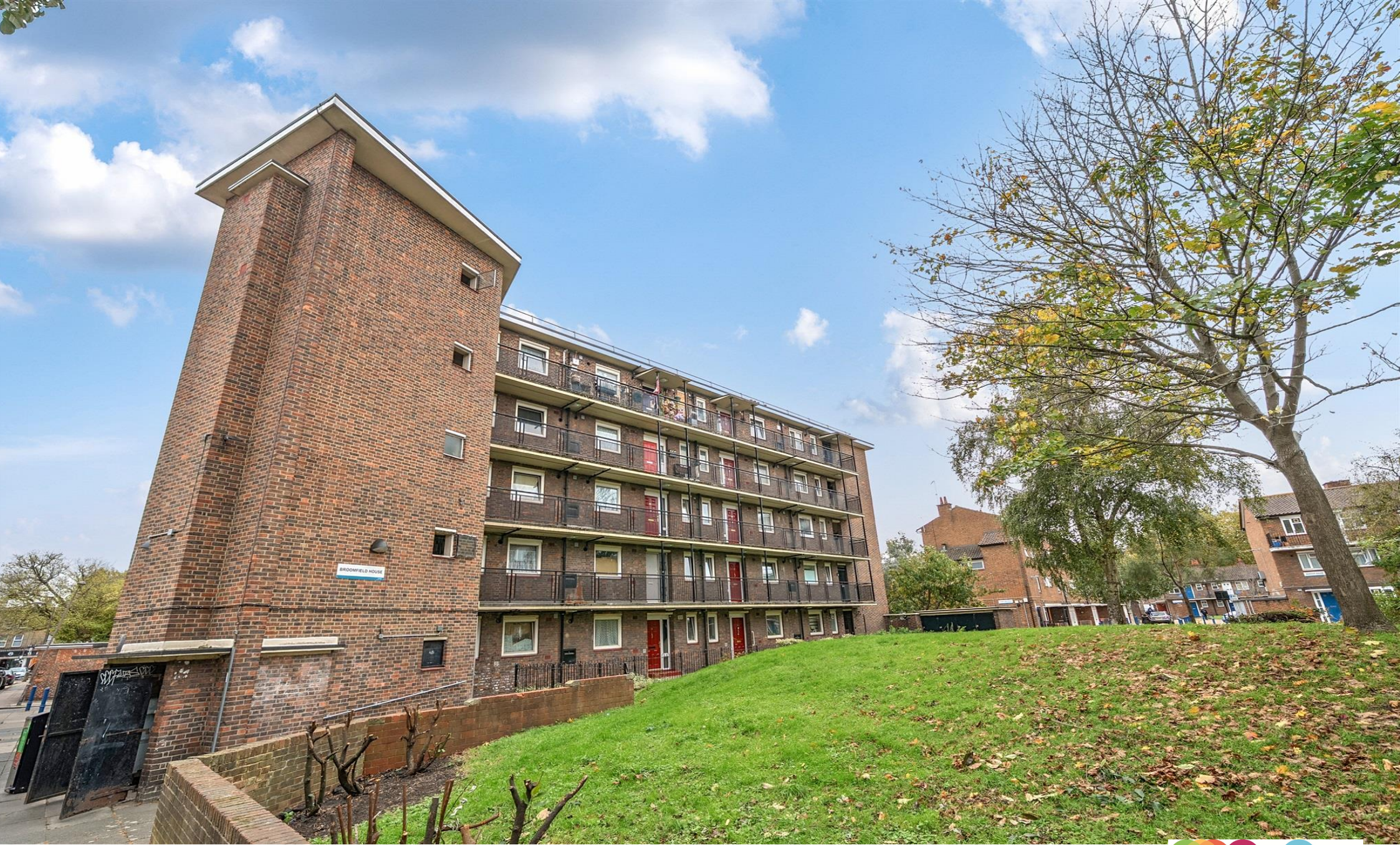
Broomfield House Massinger Street, London SE17