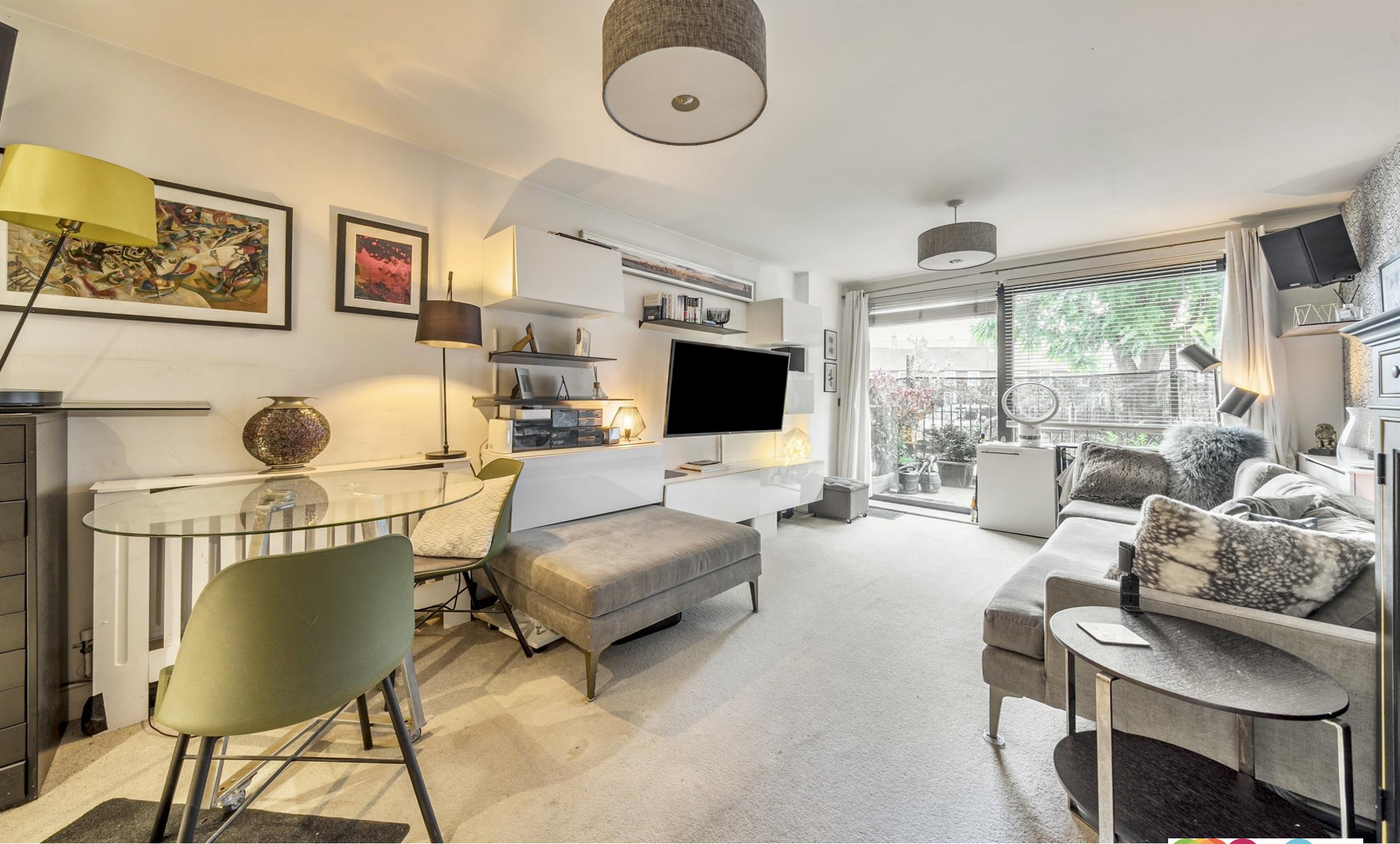
Aragon Court Hotspur Street, London SE11