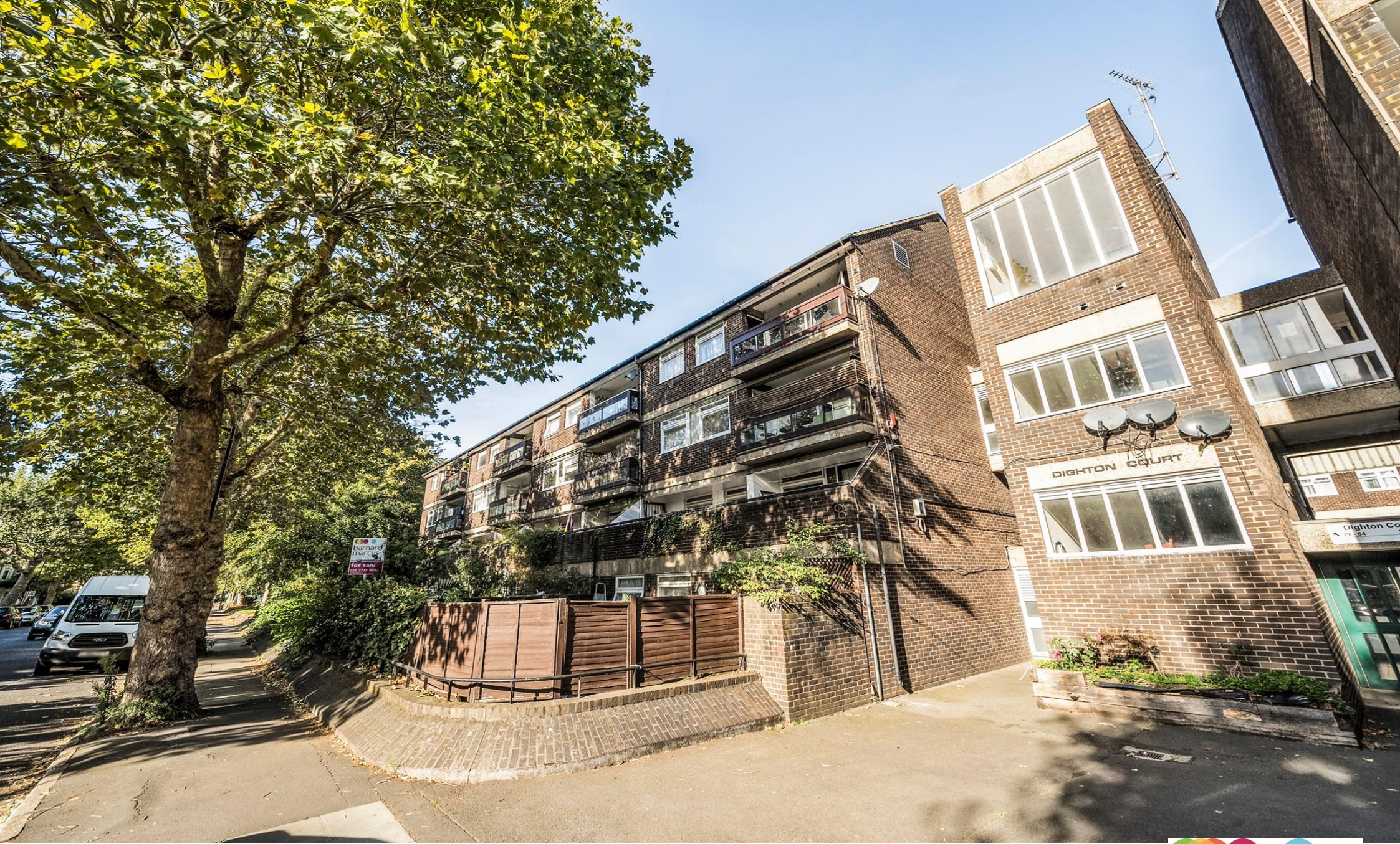
Dighton Court John Ruskin Street, London SE5