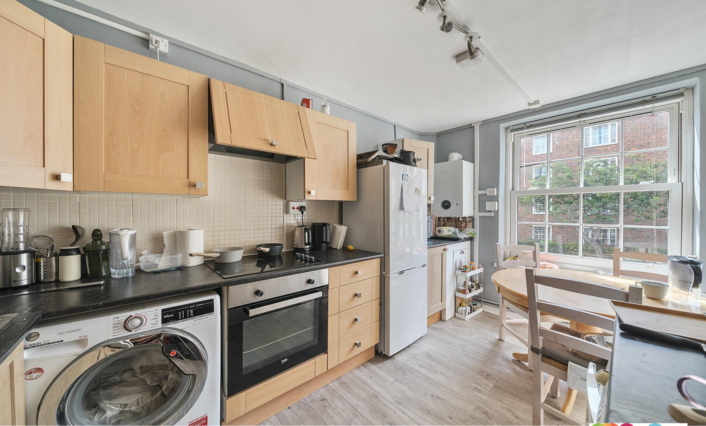
Read House Clayton Street, London SE11