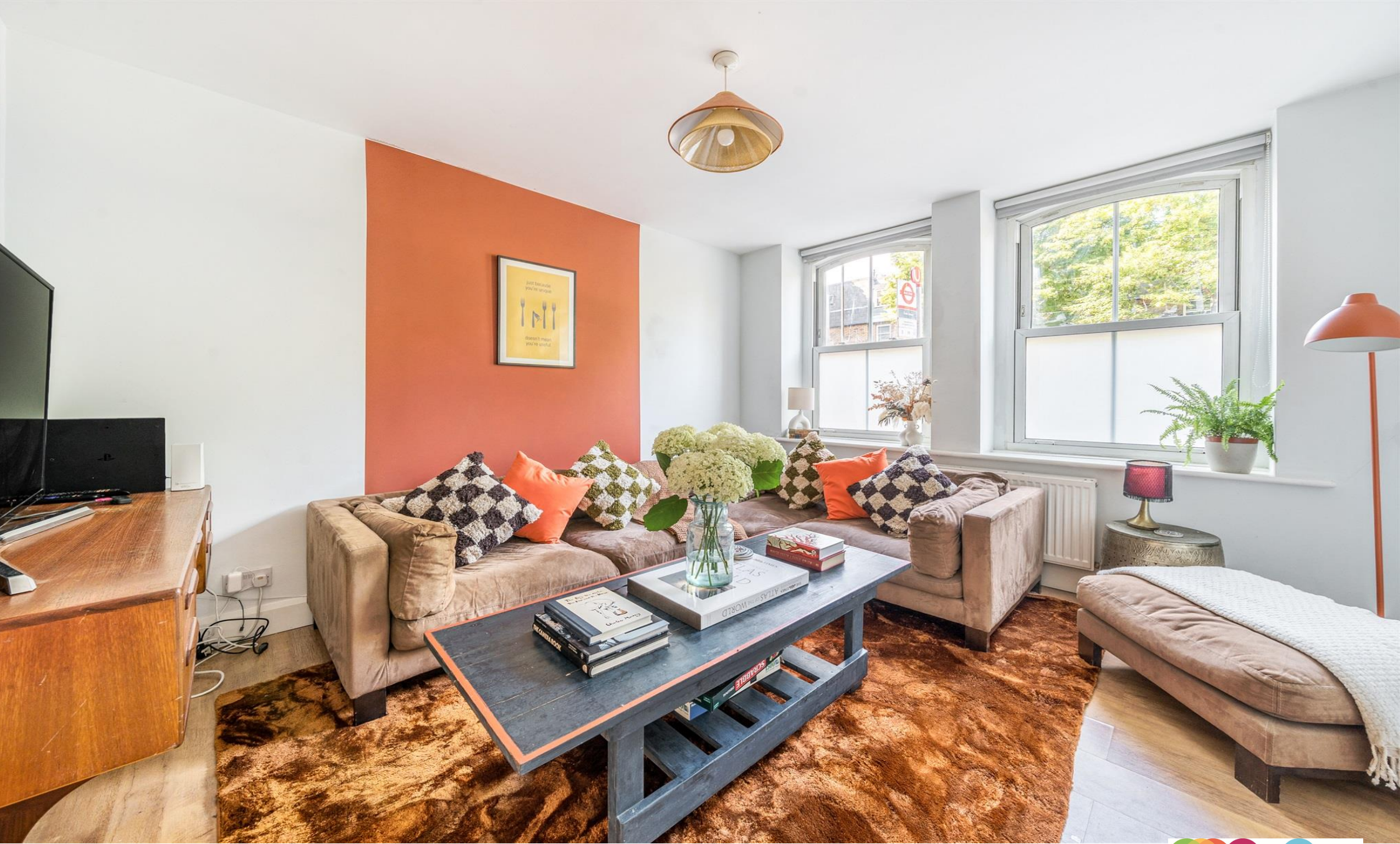
Victoria Mansions South Lambeth Road, London SW8