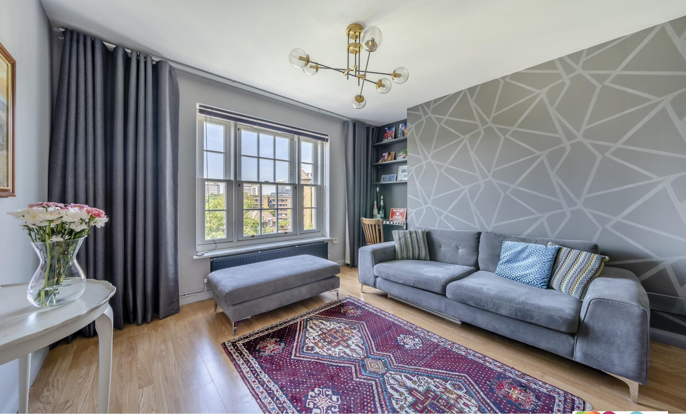
Malmsey House Vauxhall Street, London SE11