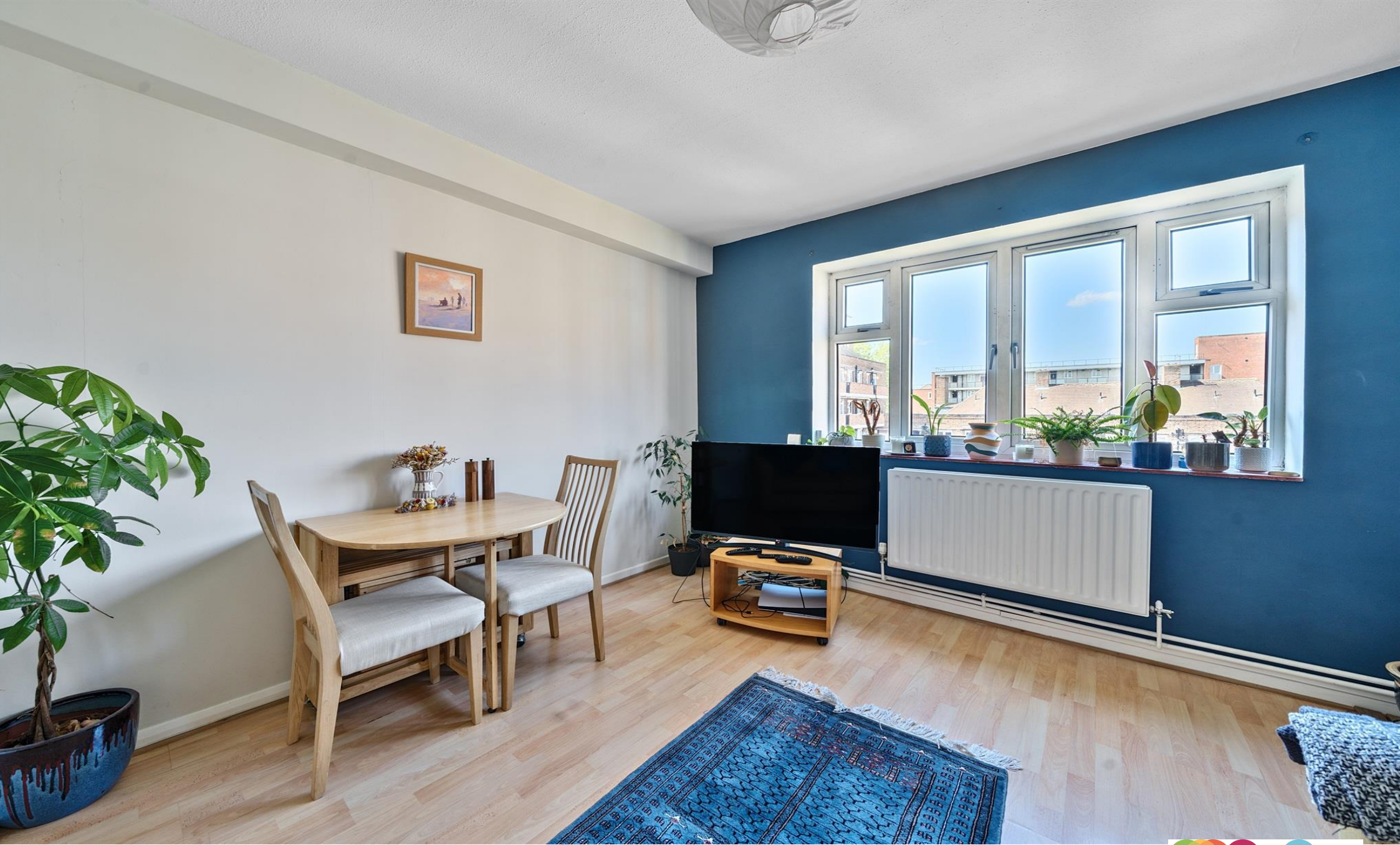
Acland House Stockwell Gardens Estate, London SW9