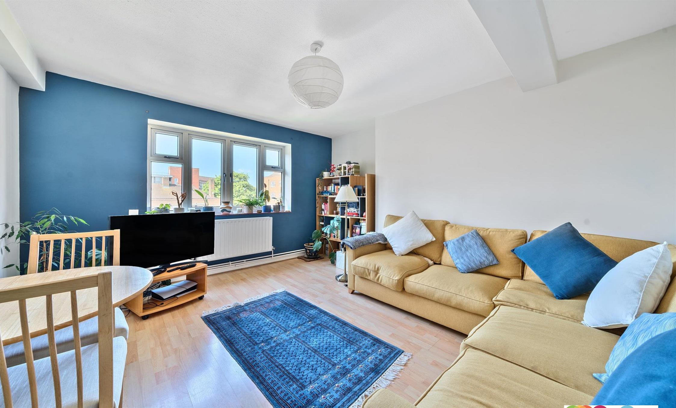
Acland House Stockwell Gardens Estate, London SW9