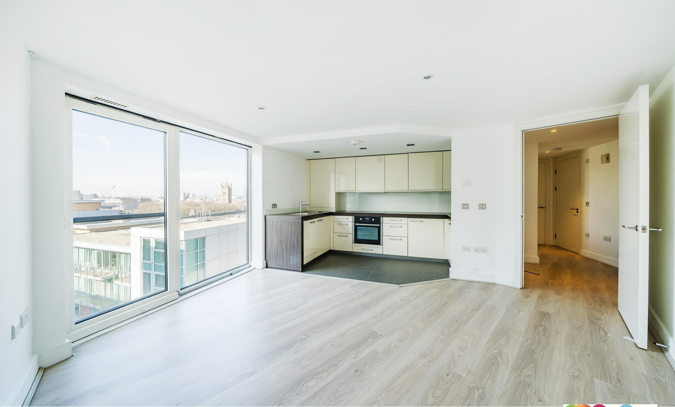
Salamanca Place, London SE1