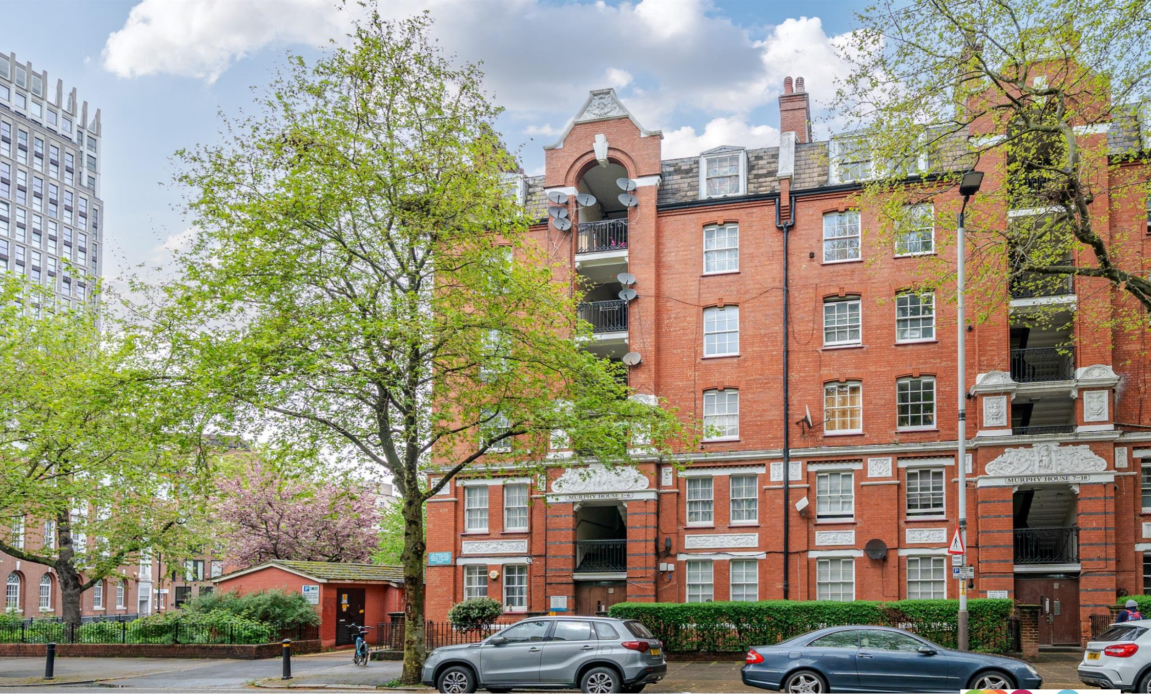
Murphy House Borough Road, London SE1