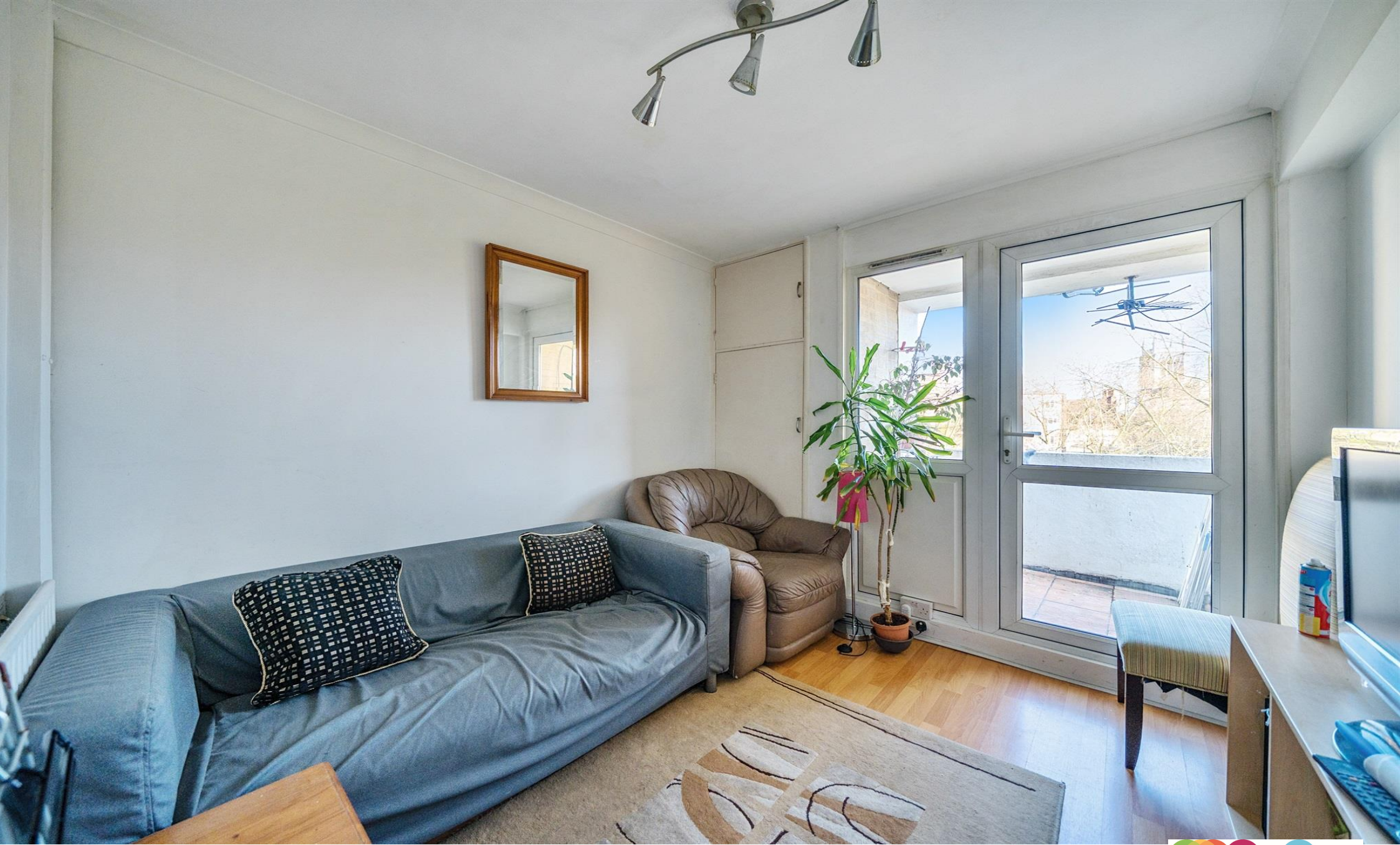
Adam Court Opal Street, London SE11