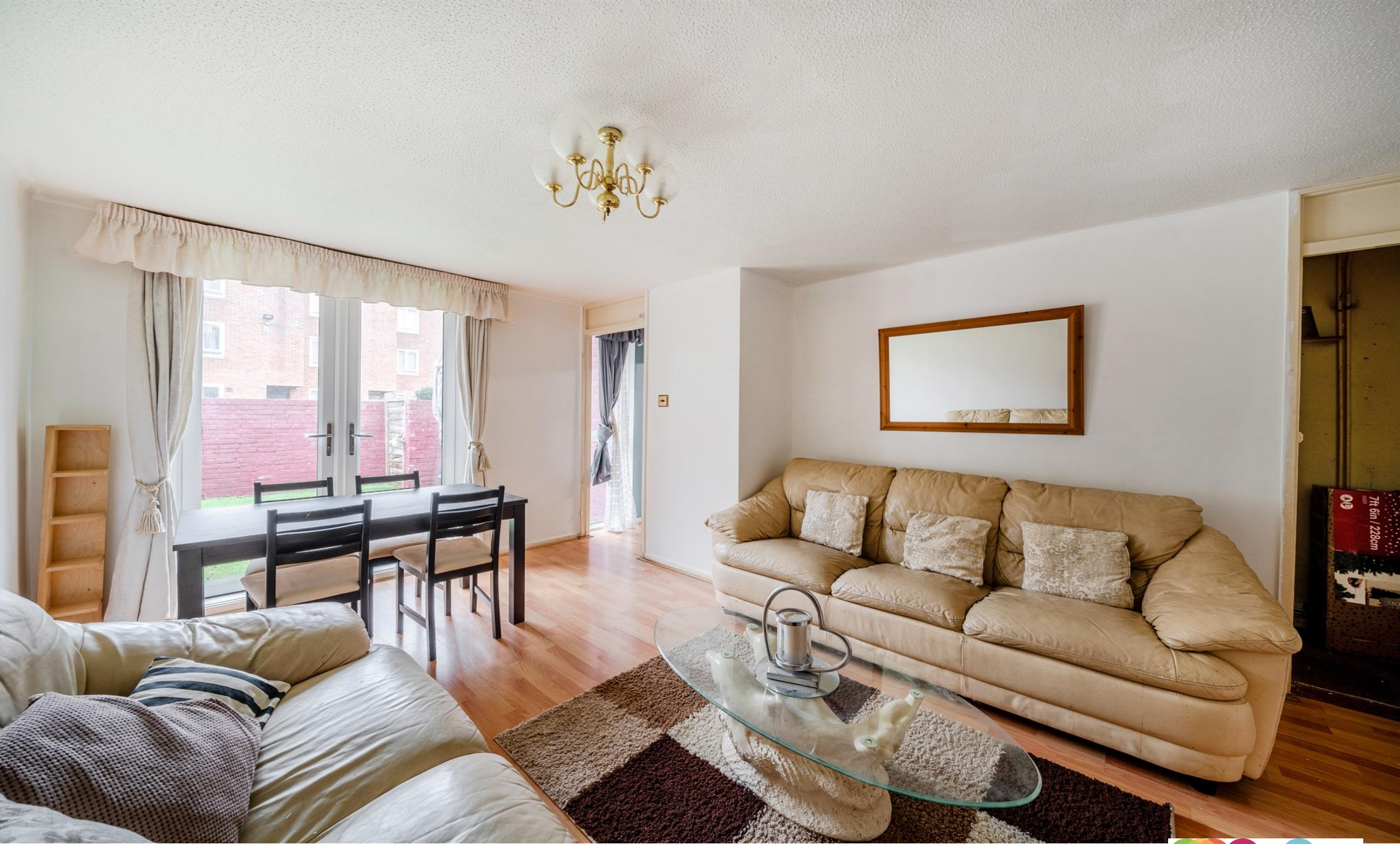
Langdale Close, London SE17