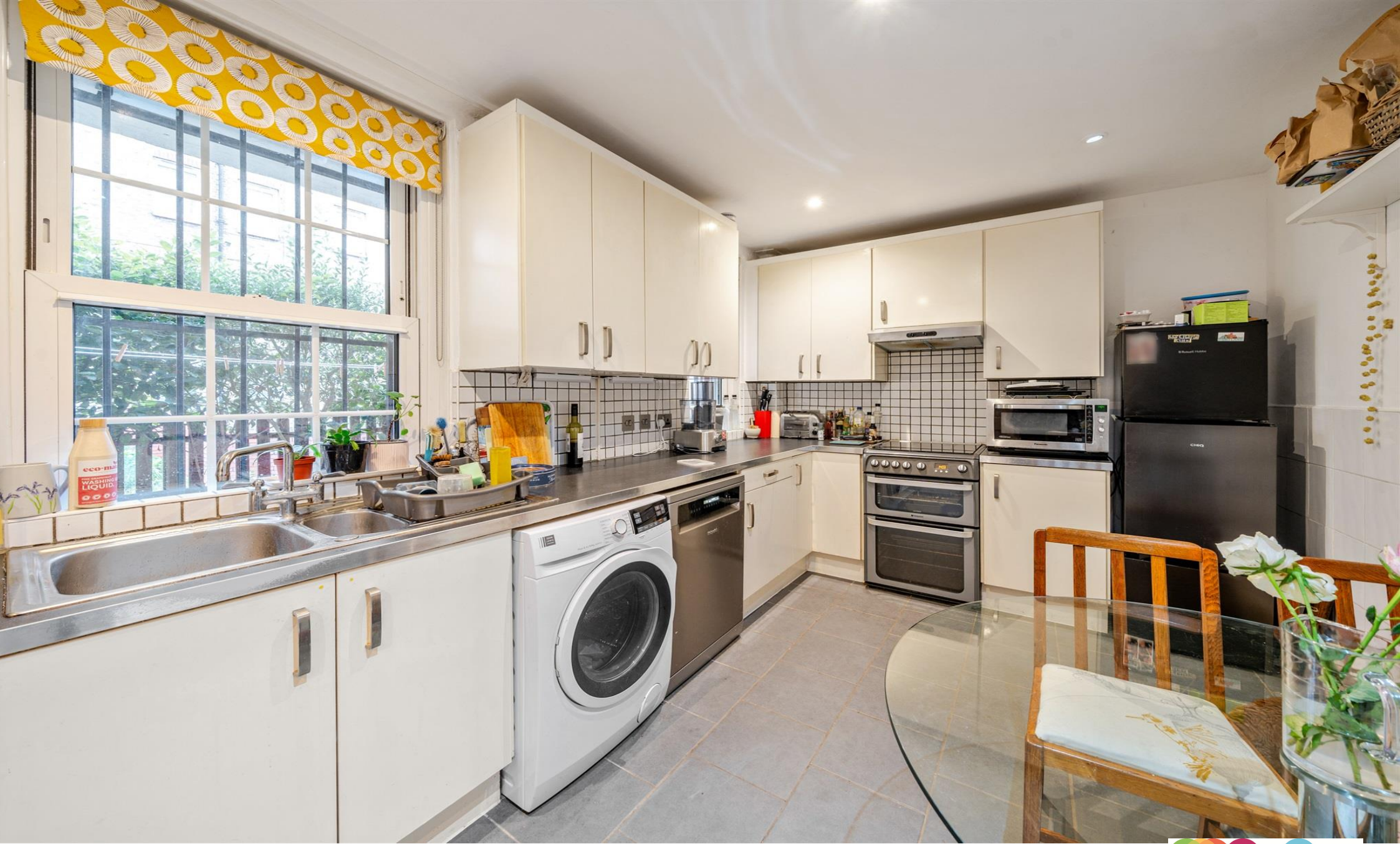
Garbett House Doddington Grove, London SE17