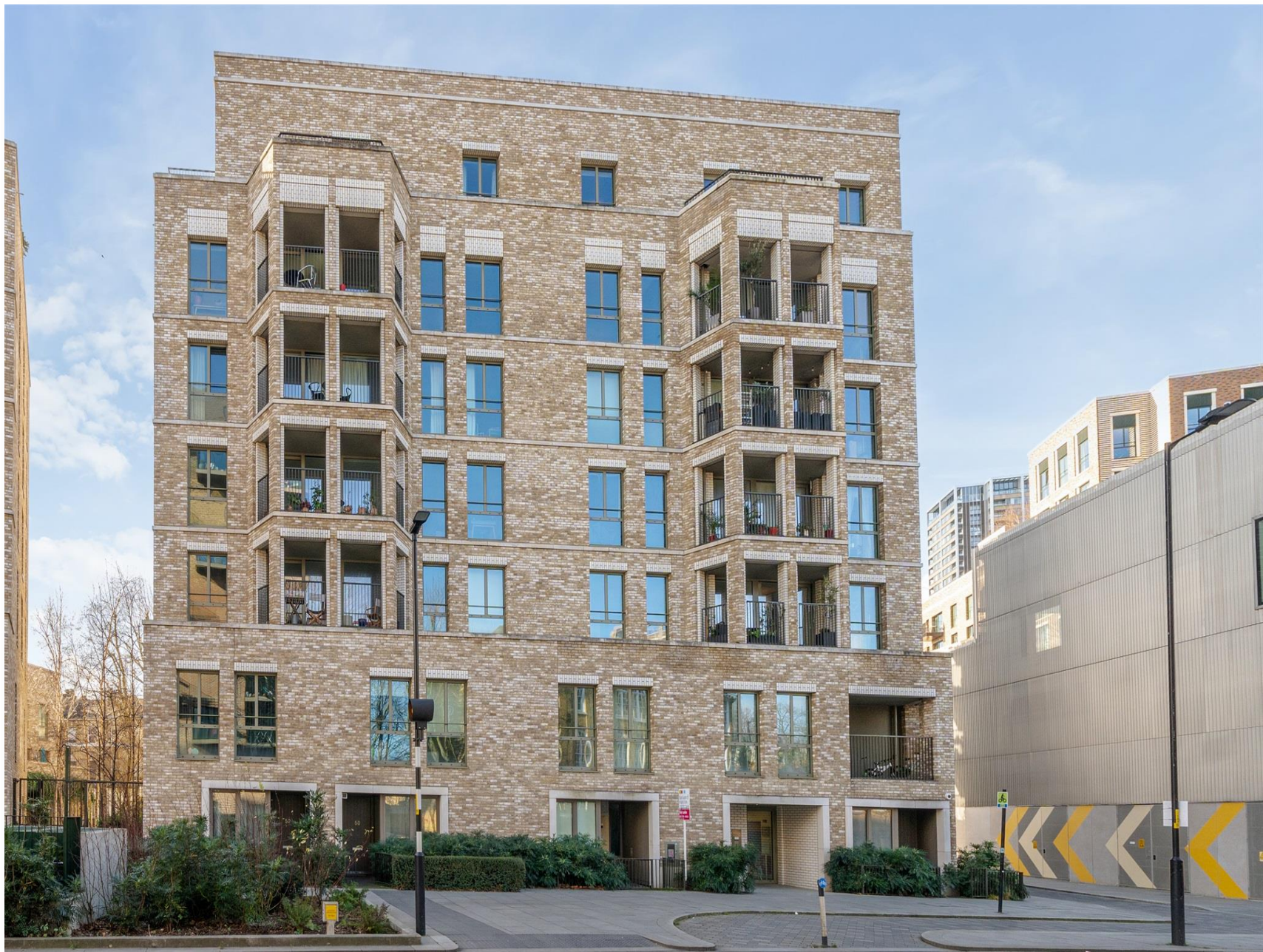
Arum House Rodney Road, London SE17