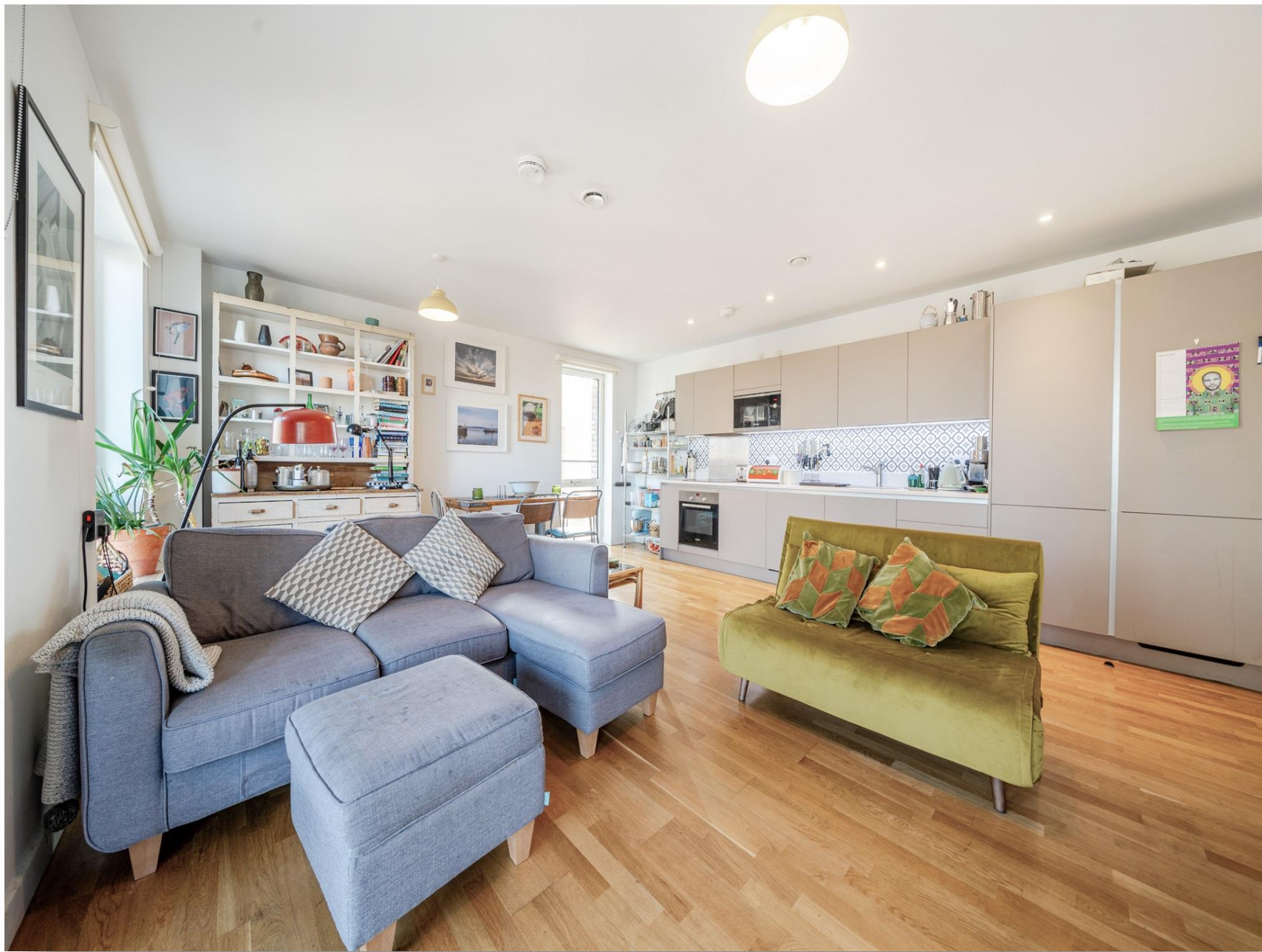
Arum House Rodney Road, London SE17