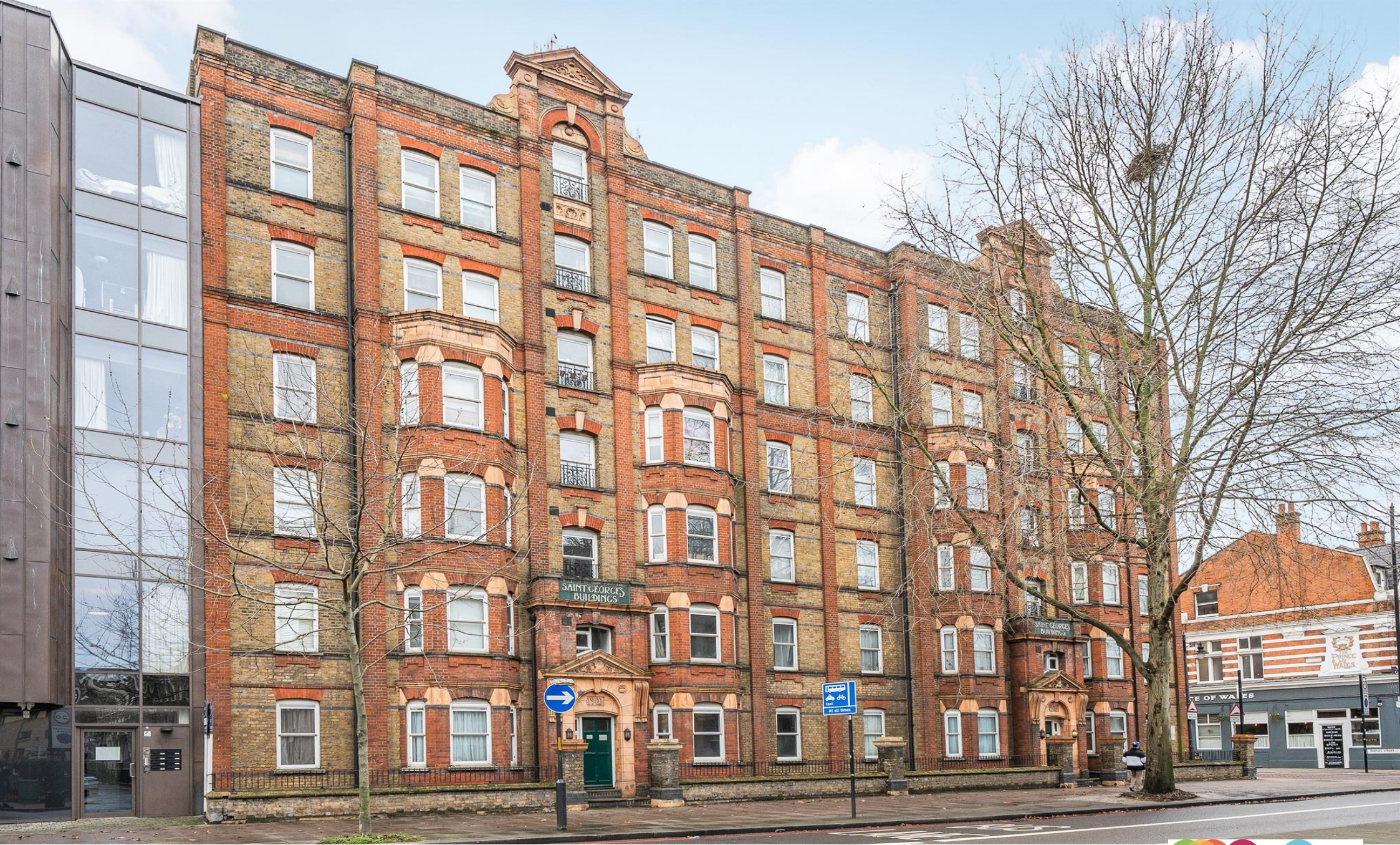
St. Georges Buildings St. Georges Road, London SE1