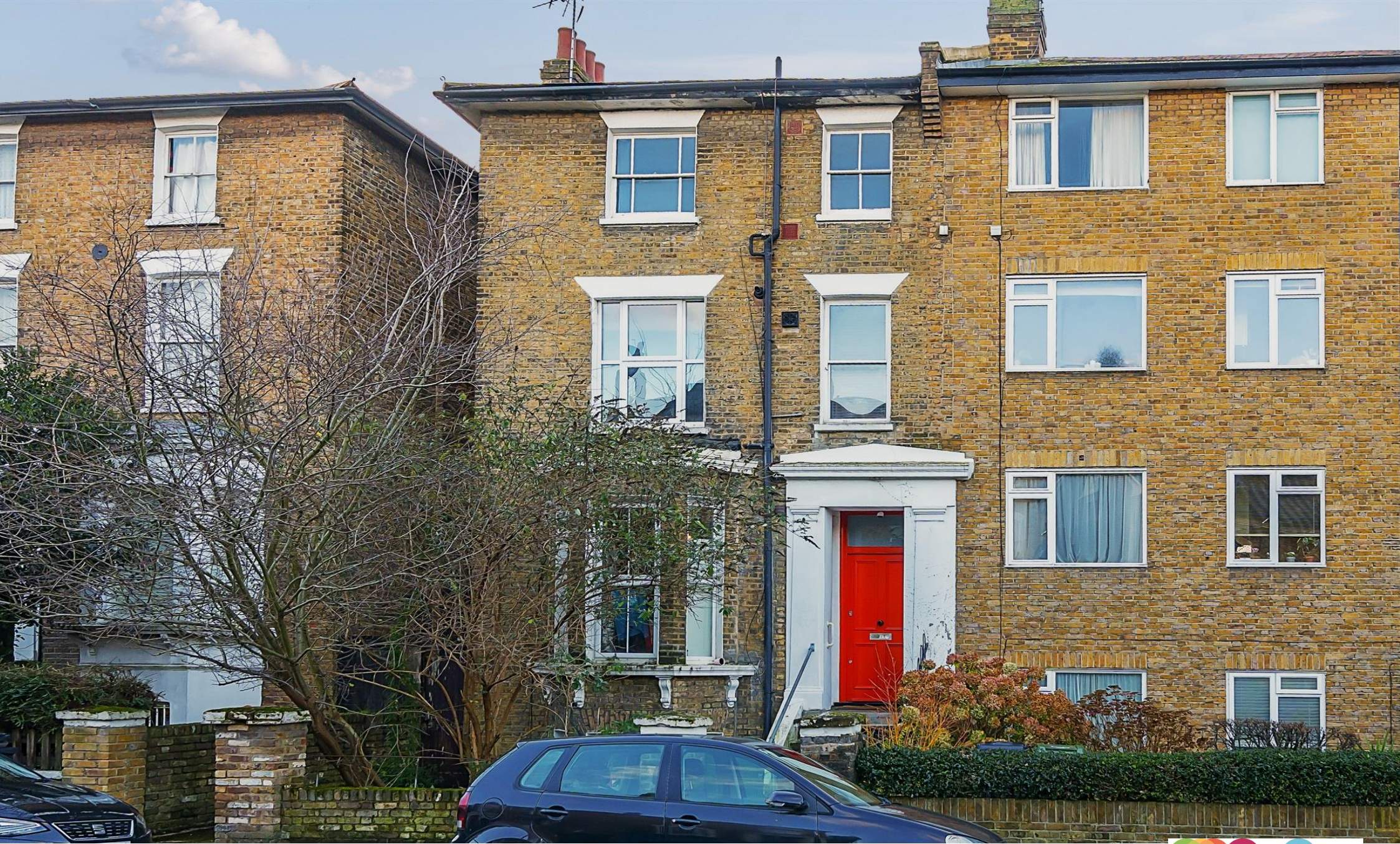
Durand Gardens, London SW9