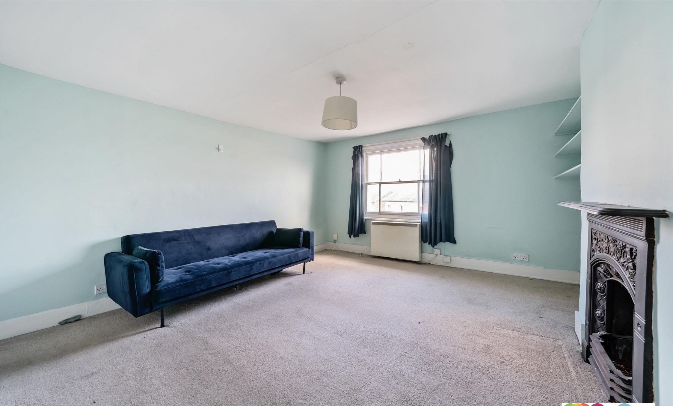
Durand Gardens, London SW9