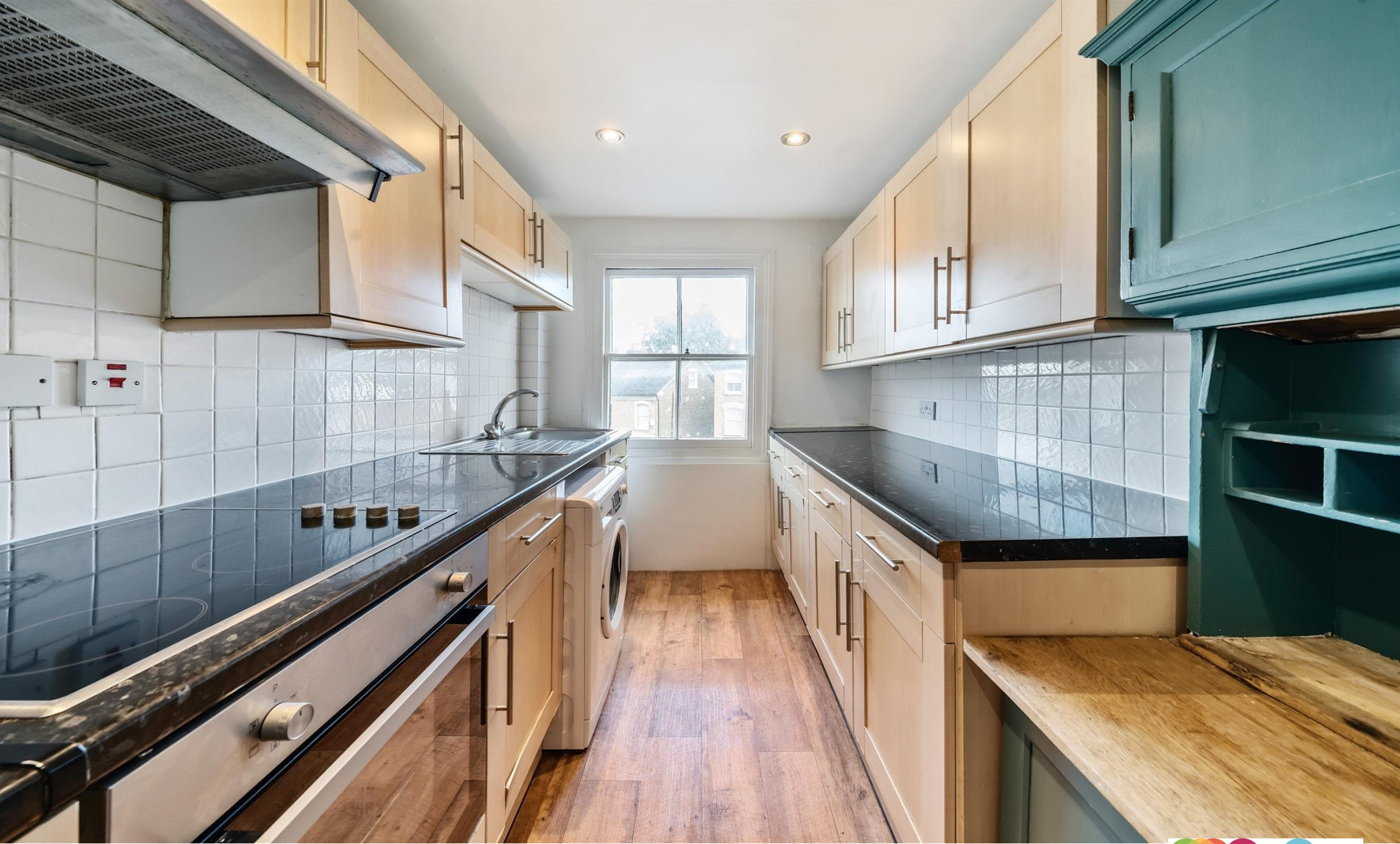
Durand Gardens, London SW9