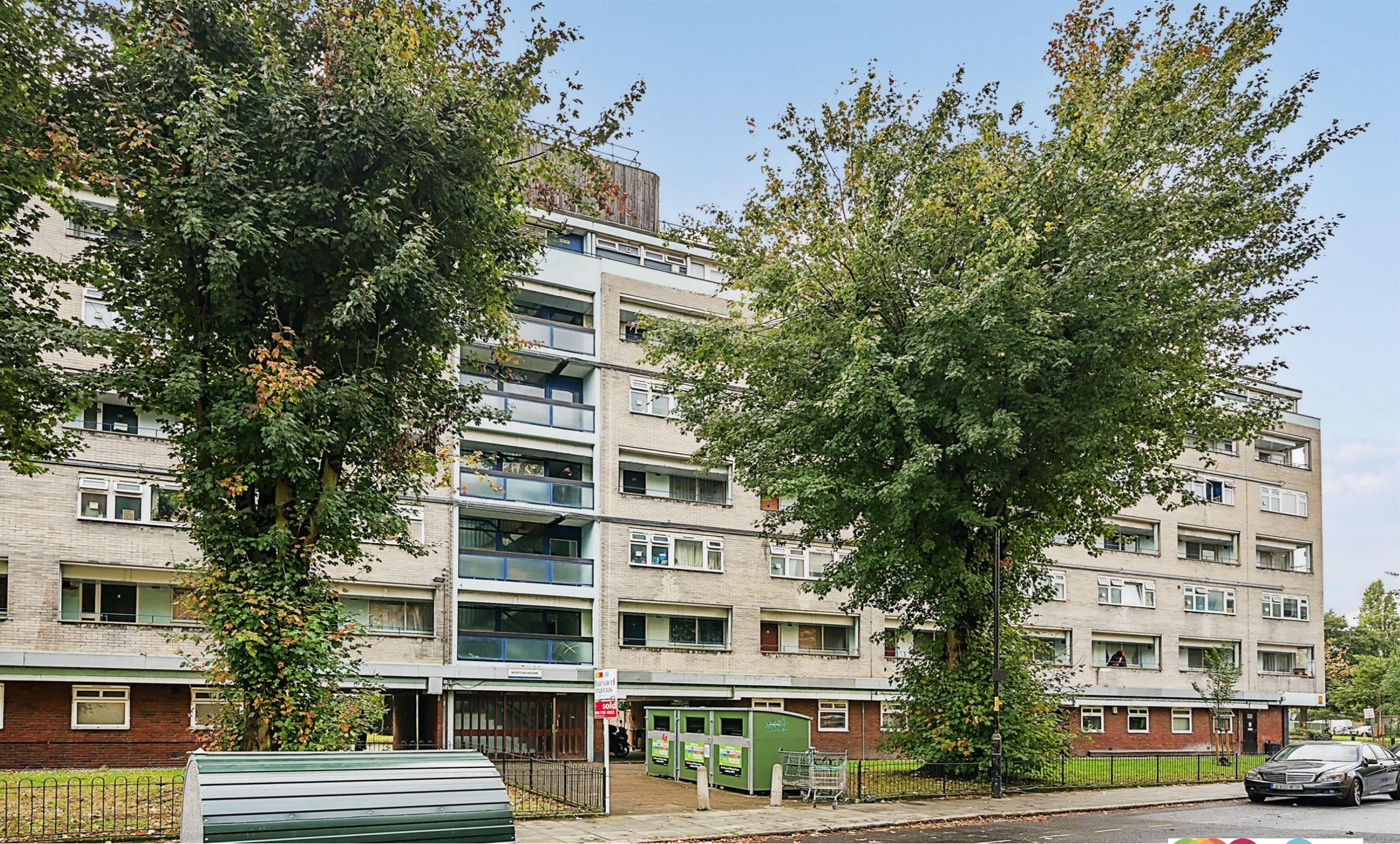
Morton House Brandon Estate, London SE17