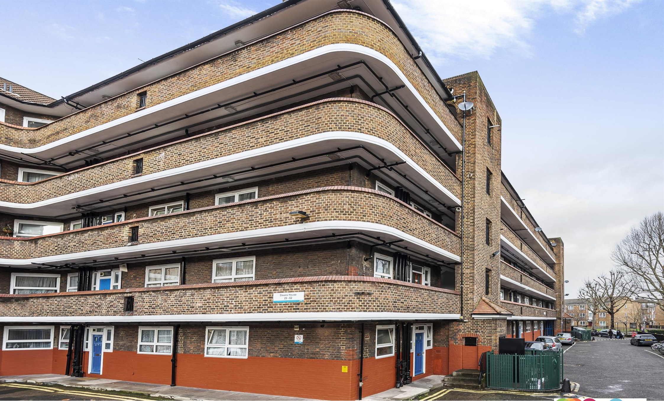
Dawes House Orb Street, LONDON SE17