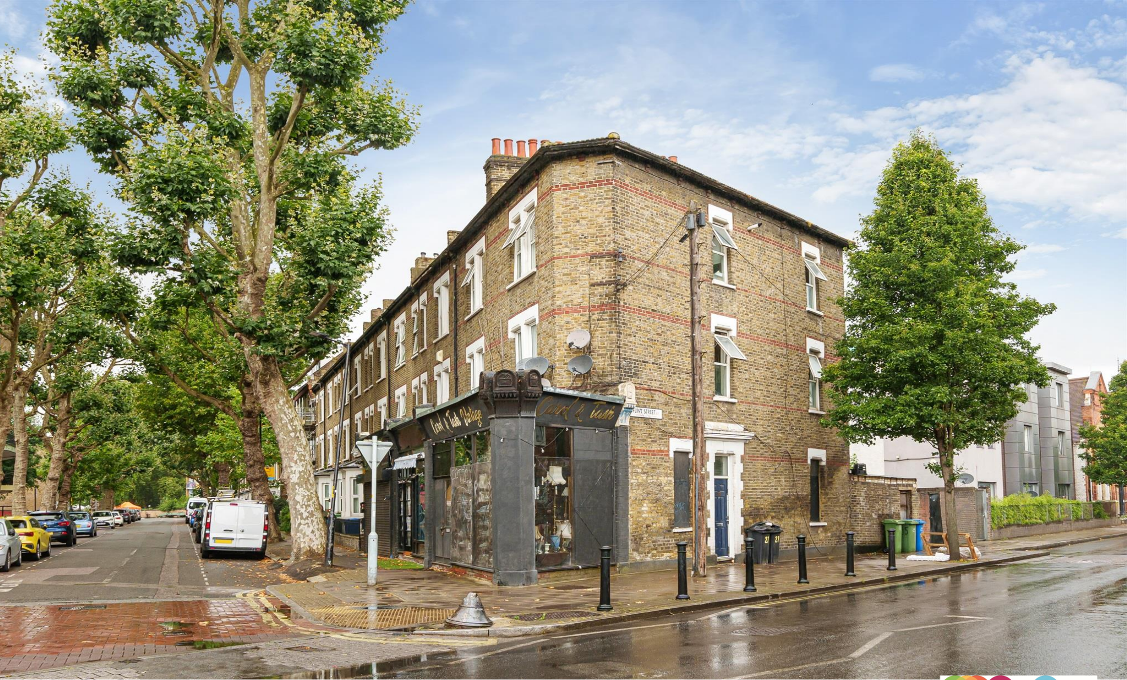
Flint Street, London SE17