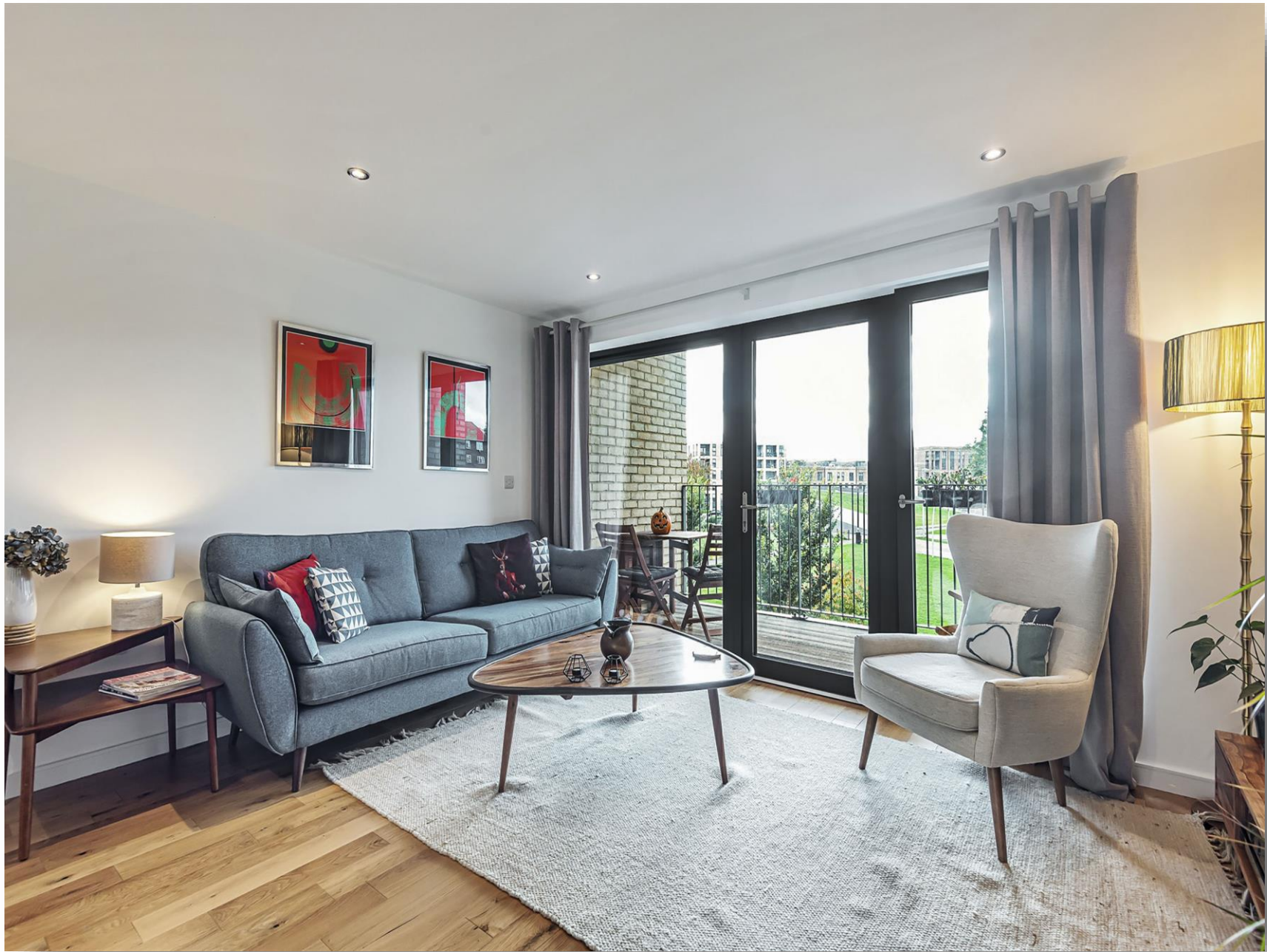
Offenham Road, London SW9