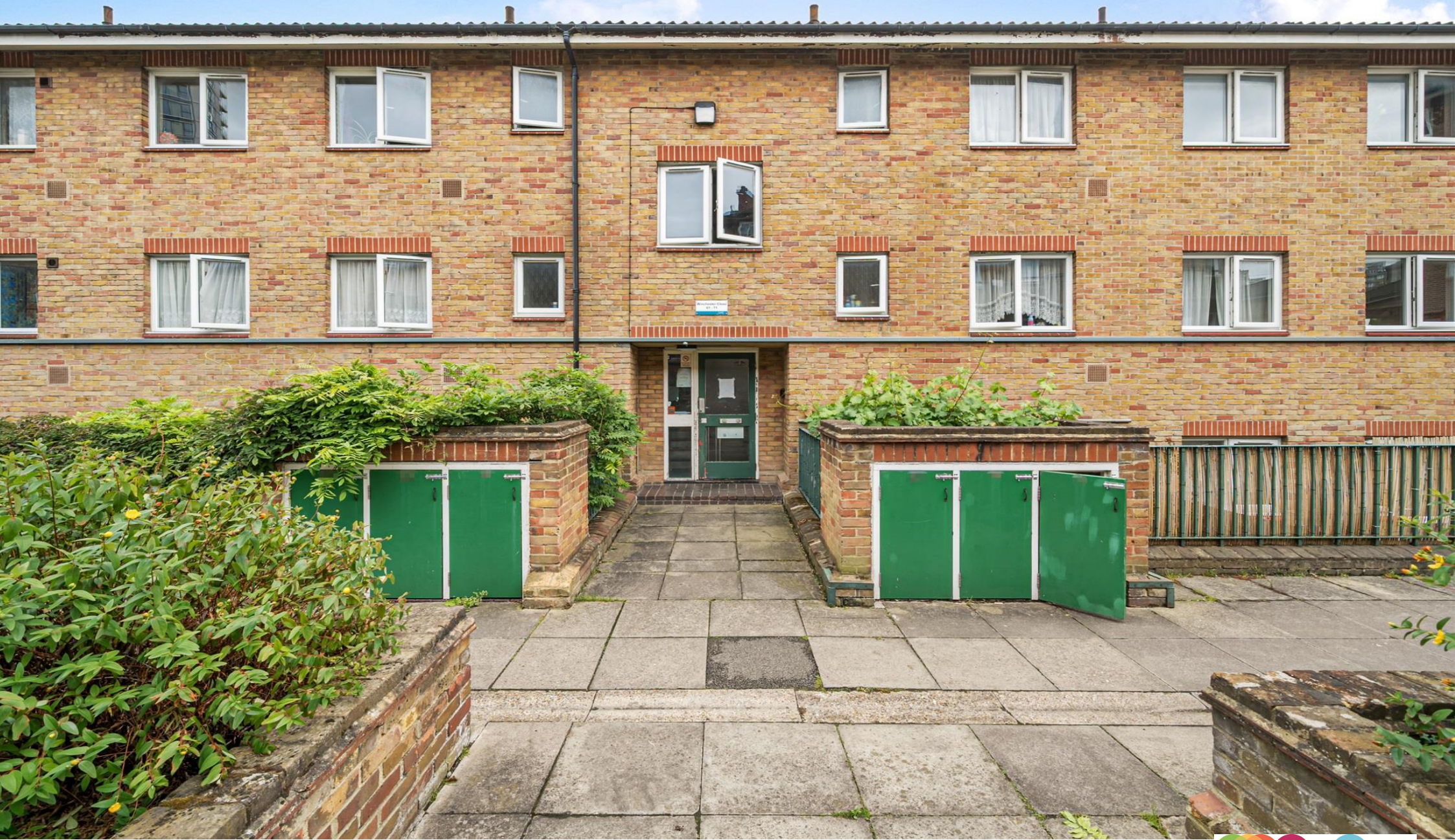
Winchester Close, London SE17