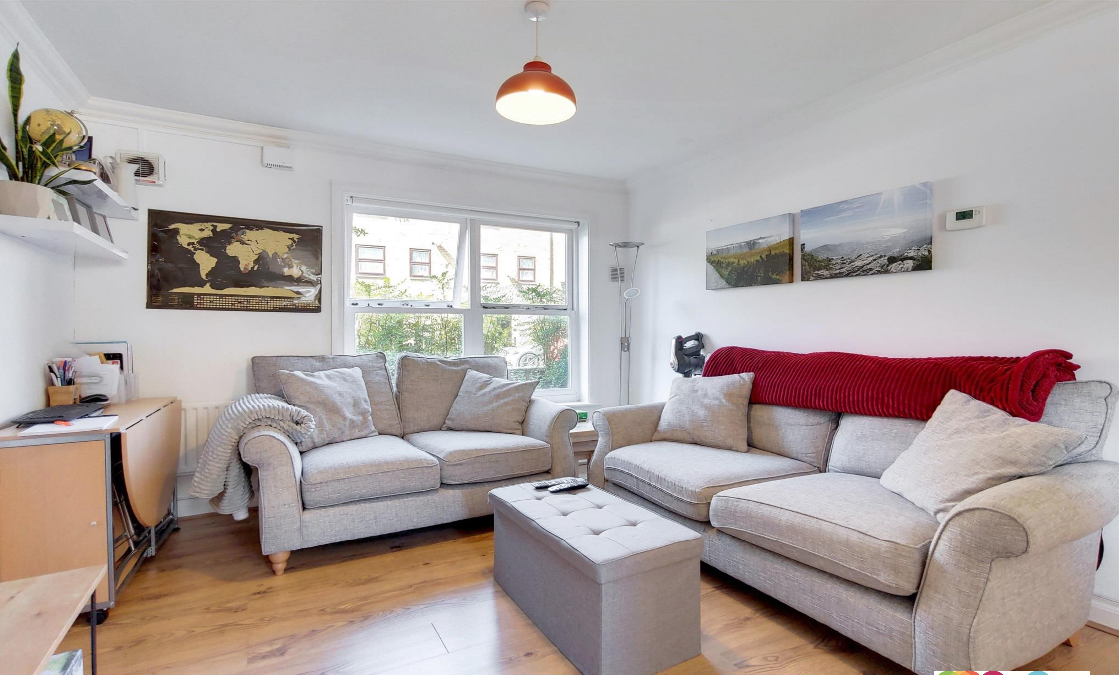
Sycamore House Langton Road, LONDON SW9