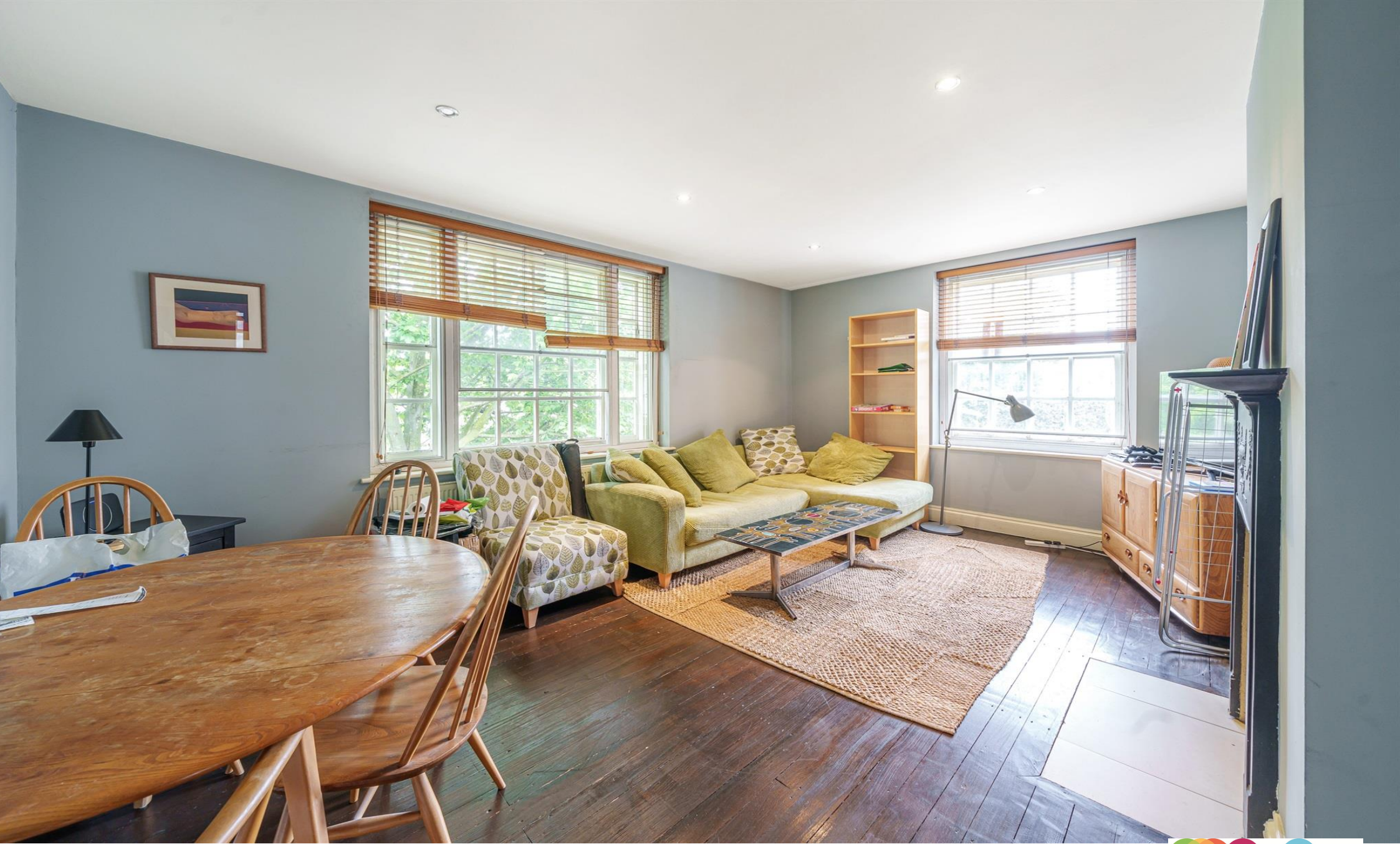
Tamar House Kennington Lane, London SE11